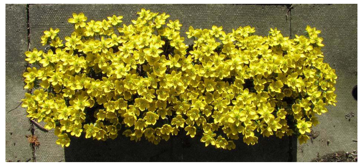
Eranthis 'Guinea Gold'

My final pictures for this week are of my troughs of Eranthis 'Guinea Gold' which are really enjoying the sunshine filling the air with the most wonderful scent of honey. As there are few flowers in many gardens at this time of year they are attracting the bees from miles around and are an important source of food for this most valuable group of pollinators