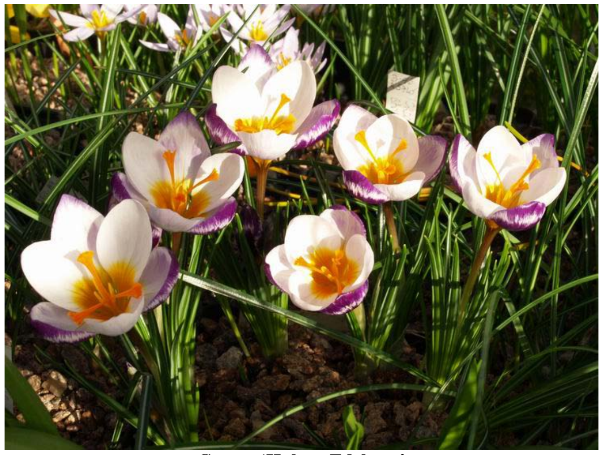
Crocus 'Hubert Edelsten'

Across in the bulb house there are a number of Crocus species putting on a display and filling the air with scent.