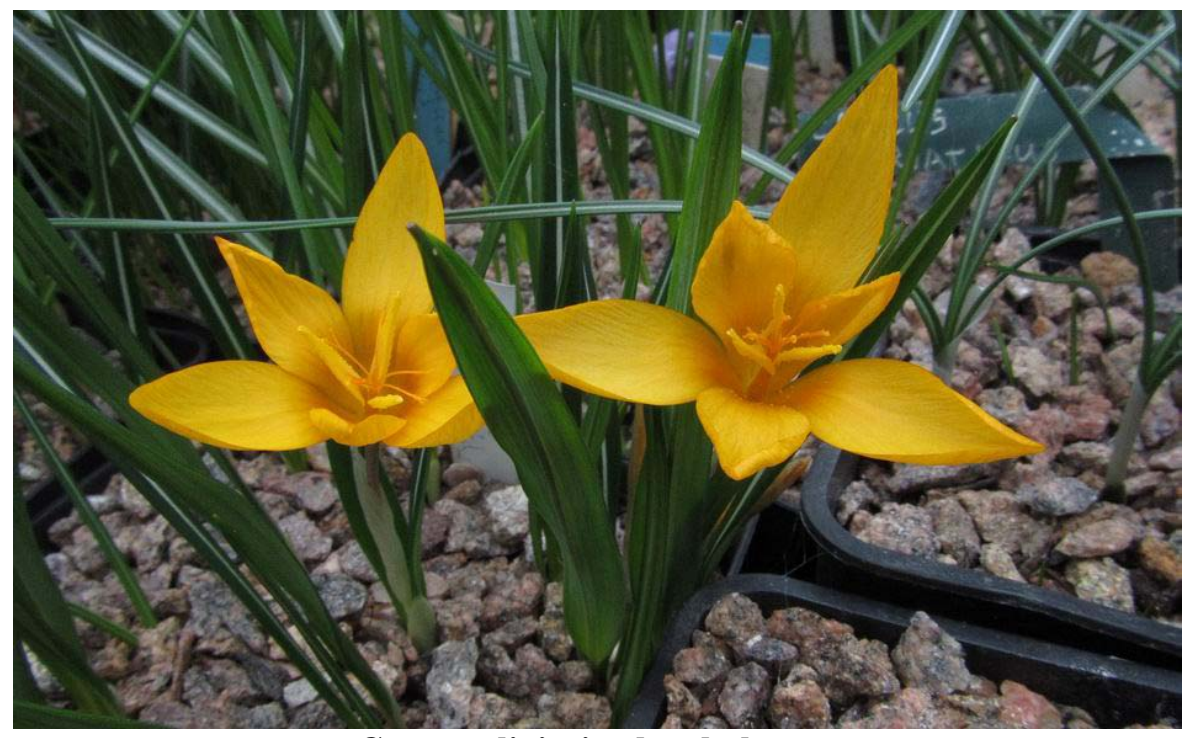
Crocus olivieri subsp balansae

On the other hand I do grow most of our Crocus cvijicii in open frames or the garden as it does much better in the cool moist summer conditions. I do keep a pot or two of seedlings inside to be able to enjoy the flowers away from the ravages of the weather and the attention of slugs - when I remember I place the pots outside for the summer.