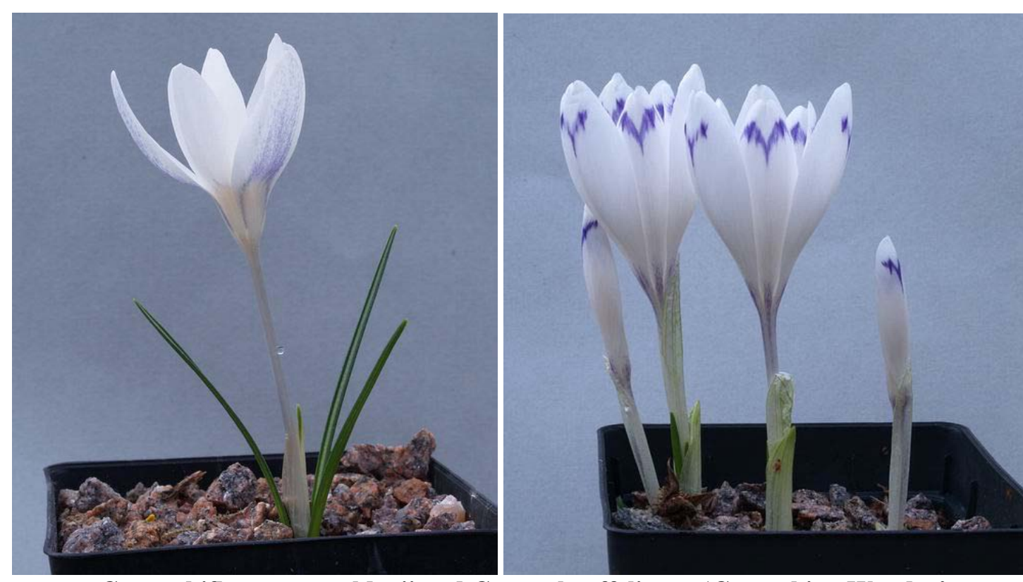
Crocus biflorus ssp weldenii and Crocus heuffelianus 'Carpathian Wonder'

The other week I said that I do not like moving pots out to photograph them and here is the perfect example of why I take that stance. I decided that this pot with a single surviving seedling of Crocus biflorus ssp weldenii would have plenty of compost and so was unlikely to have roots extending far into the sand plunge. Wrong – who would have thought that not only would the roots be exploring the sand but that a fat brittle contractile root seeking to drag the corm deeper into the ground would by sticking out like this. Obviously I handled it very carefully and after I had taken the picture I returned it to the plunge poking a hole with a pencil to accommodate the fragile root extension and watering it in well to ensure that the sand and root were in good contact again.