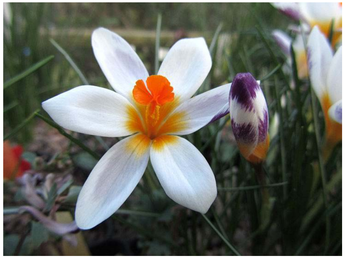
Crocus sieberi ssp sieberi

The variation within a single sub species is fascinating and Crocus sieberi ssp sieberi is no exception to this. The style is variable from a relatively simple three branched split to the wonderful frilly affair seen above. The other main variable in this subspecies is the wonderful markings on the outside of the floral segments