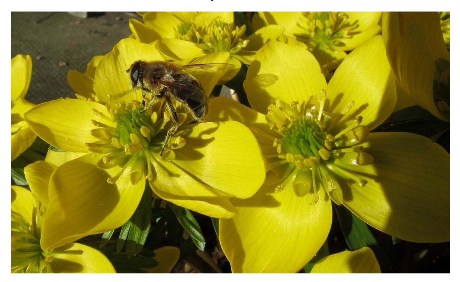
Eranthis 'Guinea Gold'

My final pictures for this week are of my troughs of Eranthis 'Guinea Gold' which are really enjoying the sunshine filling the air with the most wonderful scent of honey. As there are few flowers in many gardens at this time of year they are attracting the bees from miles around and are an important source of food for this most valuable group of pollinators