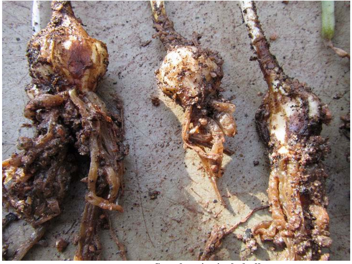
Sternbergia sicula bulbs

Having lost one pot of Sternbergia sicula completely I decided it was time to take action to see how extensive the damage was and what could be saved. I carefully tipped this pot of Sternbergia sicula out and the first thing I observed was that there was no sign of living roots so I then exposed the bulbs.