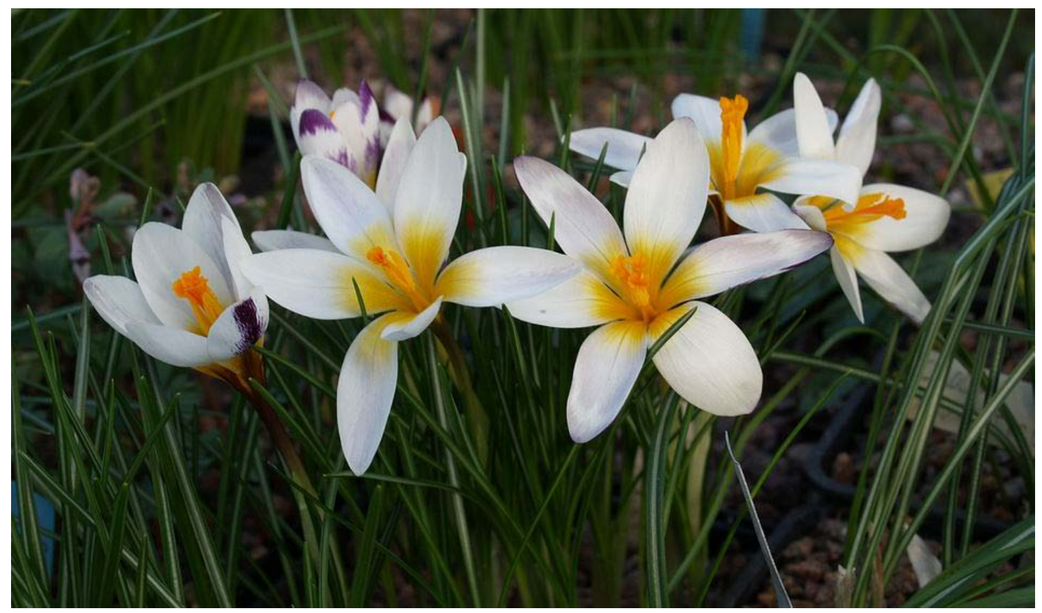
Crocus sieberi ssp sieberi.

The variation within a single sub species is fascinating and Crocus sieberi ssp sieberi is no exception to this. The style is variable from a relatively simple three branched split to the wonderful frilly affair seen above. The other main variable in this subspecies is the wonderful markings on the outside of the floral segments