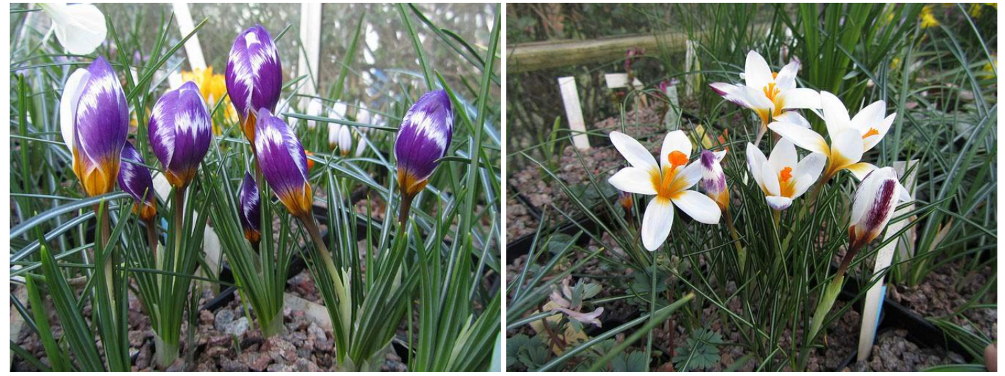
Crocus 'Hubert Edelsten' and Crocus sieberi ssp sieberi

An interesting observation is that these two close relatives close and open at slightly different temperatures. These two pictures were taken as the afternoon sun dipped in the sky and 'Hubert Edelsten' closed some time before sieberi sieberi even though they had exactly the same exposure to the fading light.