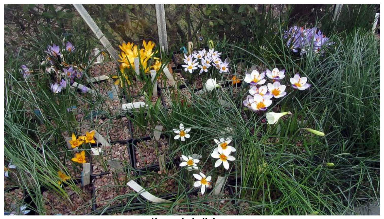
Crocus in bulb house

Across in the bulb house there are a number of Crocus species putting on a display and filling the air with scent.